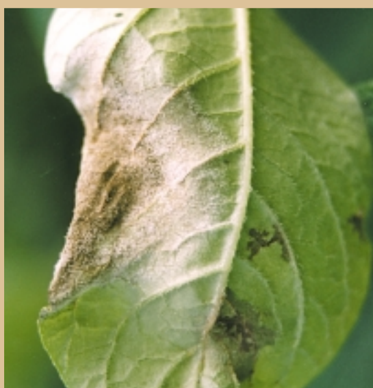
Figure 1 Typical foliar symptoms of potato blight: a large lesion with a necrotic central zone surrounded by profuse white 'fluffy' sporulation.

In the early 1980's, the status of European blight populations changed markedly. As a result of the dry summer of 1976, Mexican potatoes were imported into Europe bringing with them a much more diverse population of P. infestans that comprised A1 and A2 mating types. The 'new' population rapidly displaced the 'old' one, suggested to be as a result of its increased fitness over the existing 'old' clone which had been 'weakened' by 130 years of asexual propagation (Müller's ratchet). A major component in the chemical armoury against blight was also threatened at this time. Overuse of the curative phenylamide fungicide, metalaxyl, resulted in high selection pressure on the fungus and a build up of insensitive isolates markedly reduced the fungicide's efficacy. The arrival of the A2 mating types in the Mexican imports (not discovered until 1981 and not announced until 1984!), added a new dimension to the pathogen's biology. The occurrence of the two mating types raised the possibility that the fungus could undergo its sexual cycle in infected potato plants and form long-lived oospores. These could then be incorporated into the soil with several adverse consequences.