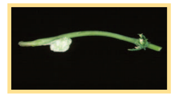
Figure 3 Stem section of C. sativa infected by wild-type Agrobacterium.

since the ability of this bacterium to infect hemp had never been reported, experiments were undertaken to confirm its potential as a transformation agent. Over 50% of hemp plants exposed to this bacterium exhibited the classic Crown gall (Fig. 3), which confirmed that genetic transformation of hemp using this vector should be possible. An efficient transformation system for hemp has now been developed.