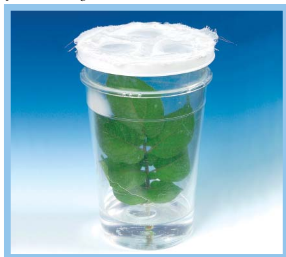
Figure 1 Aphid cage used in this study. The leaf petiole is placed into the reservoir shown at the foot of the image.

L-Ascorbic acid (AsA; Vit C) is the most abundant soluble antioxidant found in plants and is also an essential nutrient for humans and a few other animals. Together with flavonoids, polyphenolics and lipophilic compounds such as \alpha -tocopherol (vitamin E), AsA contributes to the overall intake of free radical scavengers in the human diet. Diets rich in fruit and vegetables are associated with decreased risk of certain cancers and cardiovascular diseases and this has been attributed to the high concentrations of antioxidants in such foods. Many of the plant foods consumed by humans are sink organs (e.g. fruits, tubers), non-photosynthetic tissues that receive carbohydrates and other compounds from leaves via the phloem, the transport tissue of the plant. As part of our ongoing investigations into factors contributing towards AsA accumulation in these organs, we undertook a number of studies to investigate the contribution of AsA delivered via the phloem 1,2 . Work undertaken at SCRI and in other laboratories demonstrated that AsA was a major component of the phloem sap and hence transport of AsA from leaves to fruits or tubers was a mechanism by which the compound may accumulate in these organs. An additional implication of our findings was that phloem feeding insects such as aphids would be exposed to a diet rich in AsA. This led us to consider what impact phloem AsA might have on phloem feeding insects.