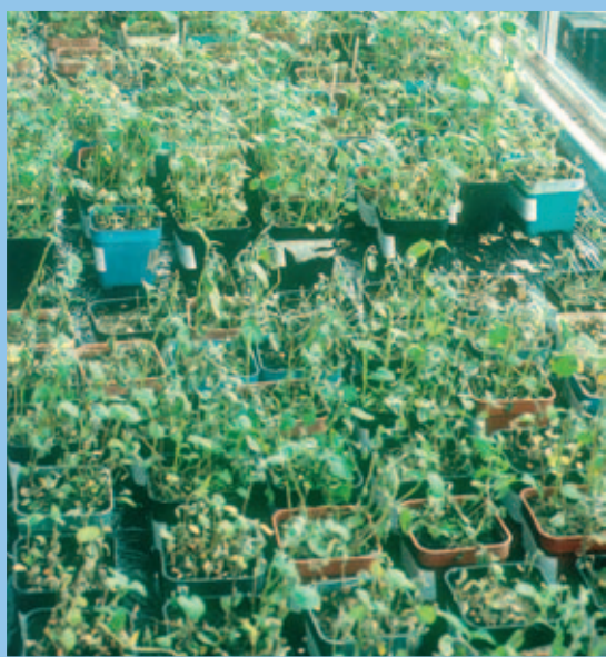
Figure 2 Progeny test for foliage resistance.

blight recorded 6 days later 2 (Fig. 2). The test has been shown to consistently rank the seedling progenies with their subsequent performance in the field, although it is not a very effective means of identifying resistant individual genotypes within progenies. It has been successfully used in breeding programmes at SCRI to select the best progenies within a year of making crosses, to estimate breeding value of parental genotypes, and to identify resistant accessions of wild species of the CPC for genetic studies as well as introgression into the cultivated potato ( S. tuberosum ).