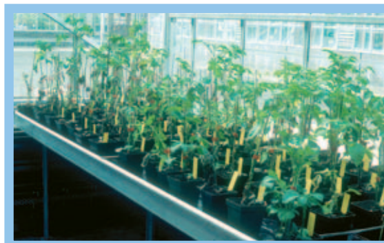
Figure 3 Glasshouse whole plant test.

Glasshouse Whole plant test Plants are raised in the glasshouse until just prior to flowering, the stage of growth at which resistance is best expressed. They are sprayed to the point of run-off with a zoospore suspension ( 5 \times 10^4 spores/ml) of a complex race of P. infestans , incubated at 15°C, and kept at high humidity for the first 24 hrs to keep the leaves wet to enable infection. The amount of blighted foliage is recorded 7 days after inoculation on a 1-9 scale of increasing resistance 3 (Fig. 3). The test broadly agrees with field assessment, but the difference in score between the most resistant and most susceptible genotypes is smaller in the glasshouse than in the field trial, leading to underestimation of both resistance and susceptibility. It is therefore important that the glasshouse plants are reduced to a single stem and raised well spaced out in a cool glasshouse in order to produce sturdy plants that most closely reflect field behaviour. The test enables assessment of several hundred individual