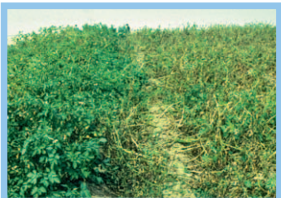
Figure 1 Potato crop infected with late blight.

Foliage resistance Progeny test True seedlings, 5 to 7 weeks from sowing and about 10 cm tall, are sprayed with a suspension of P. infestans containing 5 \times 10^4 zoospores per ml. A complex race capable of overcoming any R-genes present is used, and the amount of