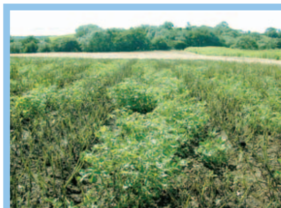
Figure 4 Field trial.

The field trial This is carried out on a farm near the west coast of Scotland, where the climate favours blight 3 (Fig. 4). It is inoculated with a single race of